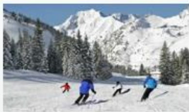
Inclusive Club Trip!! 12/12 – 12/20/2020 Snowbird/Alta

Lone Star is heading back to the pristine (and world-known) powder of both Snowbird and Alta (pronounced AL-TUH not ALL-TA - they'll kick you off the mountain for that! Staying at the Cliff Lodge, the only Ski-In and Ski-Out lodge on the mountain, you are minutes away from Alta and a short 26 miles from Solitude.