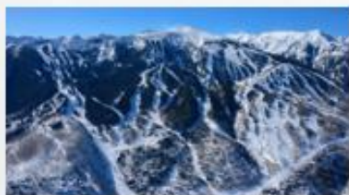
Traditional 2021 1/16-23/2021 Snowmass, Colorado

Lone Star is heading back to the pristine (and world-known) powder of both Snowbird and Alta (pronounced AL-TUH not ALL-TA - they'll kick you off the mountain for that! Staying at the Cliff Lodge, the only Ski-In and Ski-Out lodge on the mountain, you are minutes away from Alta and a short 26 miles from Solitude.