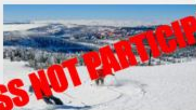
Winter Shoot Out 2021 2/20-27/2021 Purgatory, Colorado

Snowmass is a ski resort located in the town of Snowmass Village near Aspen, Colorado. The ski area is owned and operated by the Aspen Skiing Company as part of the Aspen/Snowmass complex. It was opened on December 17, 1967. Snowmass is the largest of the four Aspen/Snowmass mountains, comprising 3,128 acres. The mountain is most notable for its wide cruiser runs, family-friendly atmosphere, and extensive ski-in/ski-out lodging. Snowmass has the most vertical feet of skiing of any ski area in the United States, but only when the Cirque poma is running. There are 17 lifts at Snowmass: 8 high-speed quads (Two Creeks, Elk Camp, Alpine Springs, Sheer Bliss, Big Burn, Coney Glade, Sam's Knob, High Alpine), 1 high-speed six pack (Village Express), 2 gondolas (the Sky Cab - better known as the "Skittles" and Elk Camp Gondola), 2 quads (Meadows and Assay Hill), 1 double (Campground) and 2 pull lifts (Scoopier and The Cirque).