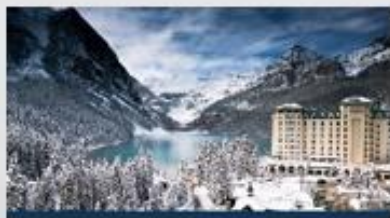
Final Showdown 2021 3/13-20/2021 Lake Louise, Canada

Purgatory Resort is a ski resort located in the San Juan Mountains of Southwest Colorado, 25 miles north of the town of Durango. Established in 1965, Purgatory offers 99 trails, including 5 terrain parks, over 1,500 skiable acres, 88 trails and 12 lifts, including one six-person and one high speed quad lift. Average annual snowfall is 260 inches per year, and artificial snow is produced on approximately one-fifth of the mountain. The elevation at the summit is 10,822 feet, with a vertical drop of 2,029 feet.. Can sign up with any sister club